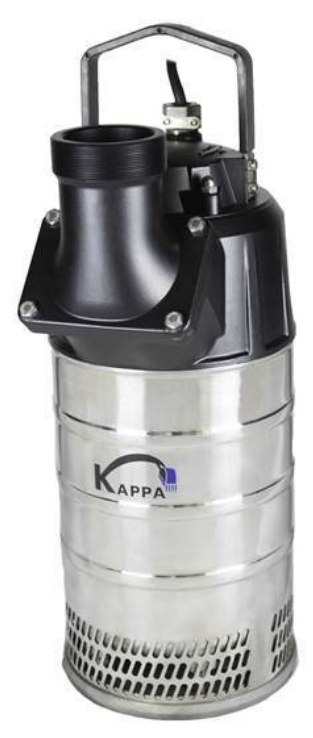
Attention: pictures for illustrative purposes

Installation: Vertical Floating on board machine: not present